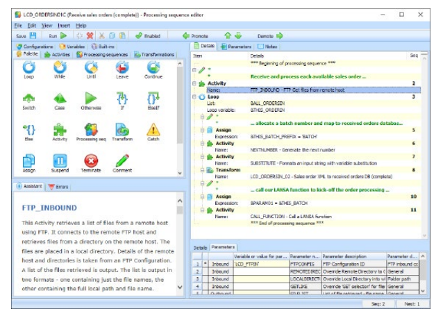
Using the processing sequence editor you can easily define business activities without coding.